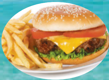
Cheeseburger and Fries $6 Please specify if you do not want cheese

Please Join us Friday, August 19 Dining inside the Hall between 5:30 PM and 7:00 PM Doors open at 5:00 PM; however, serving will begin at 5:30 PM.