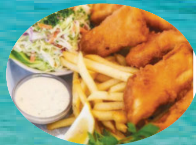
Deep Fried Fish $10 Salmon/Spicy Salmon $12 Salmon Caesar $12 Grilled Fish $10 ($1 Discount for Seniors 59+)

Various Sides: Mac & Cheese, Rice pilaf, Coleslaw, Cesar Salad, French Fries, Fresh Fruit